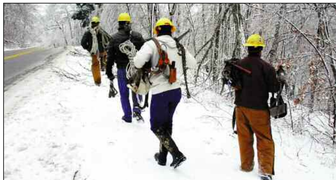
Opposite page, Singing River Electric crews encounter various weather and challenges as they make their way around Salt River Electric's service territory to restore power.